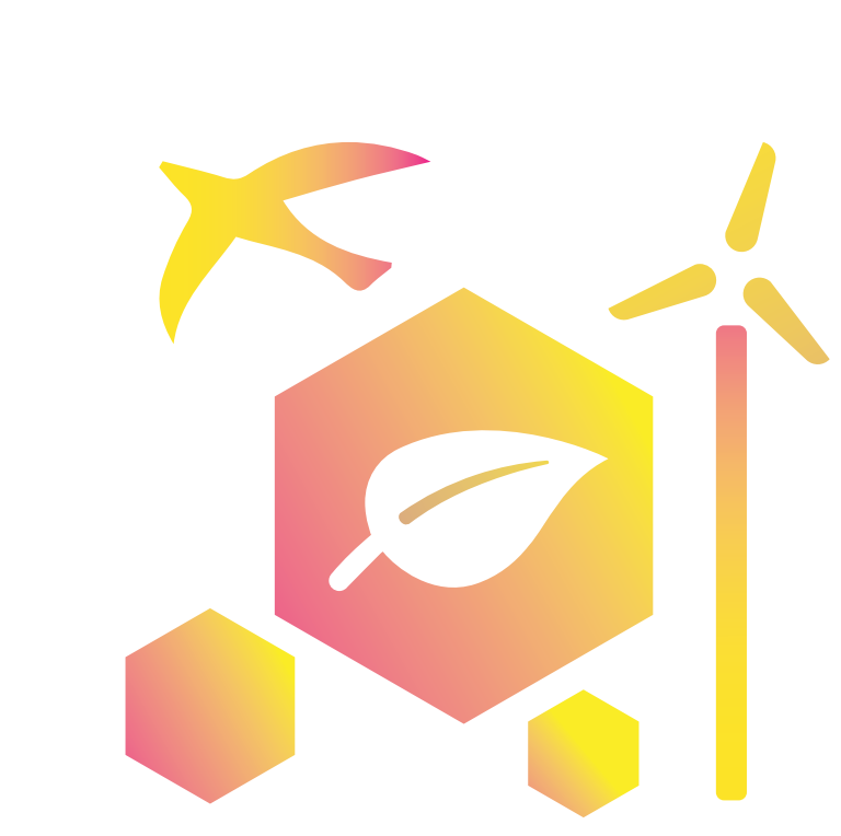
Open Call #5 Green scalable and sustainable DLTs