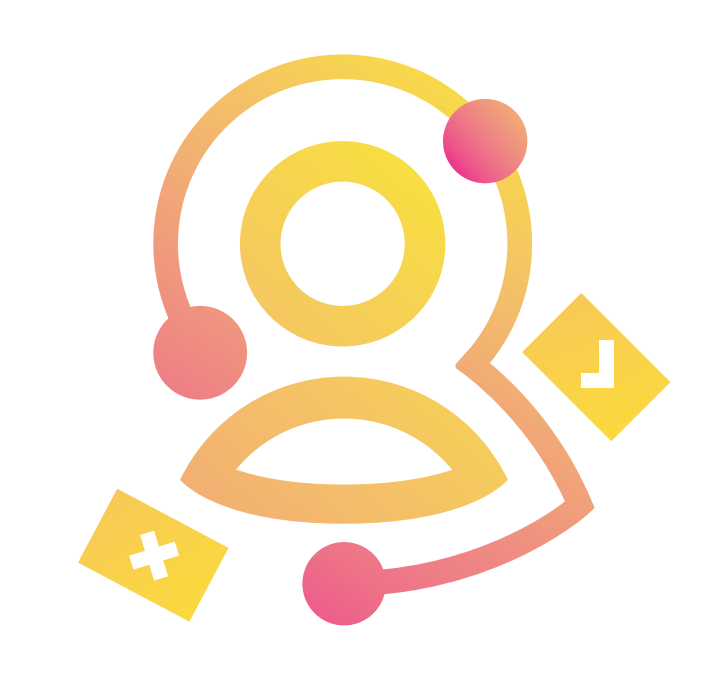
Open Call #1 Decentralised digital identity