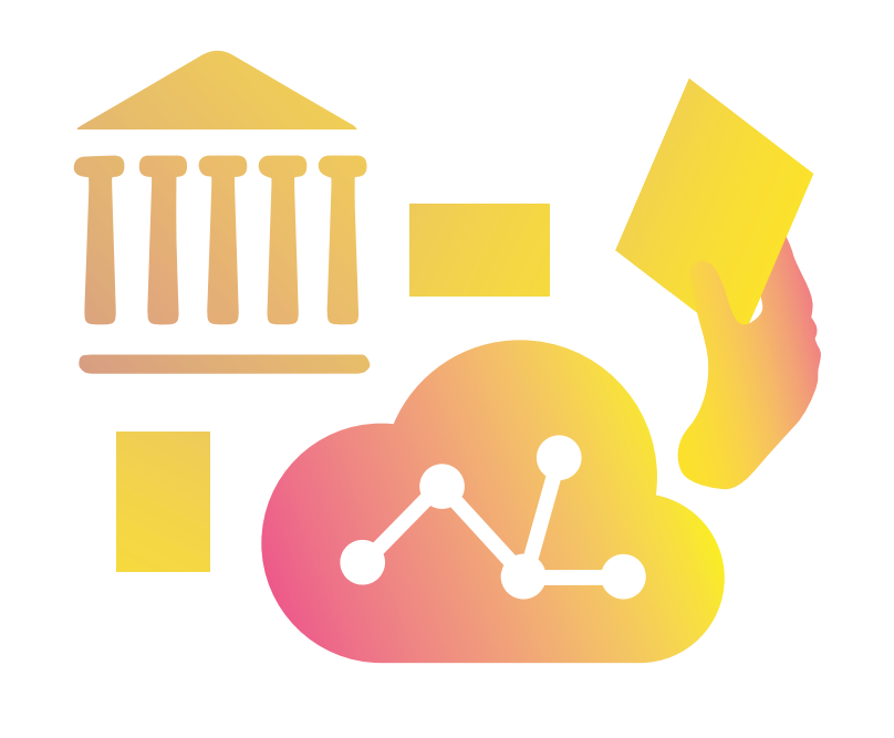
Open Call #3 Economics and democracy