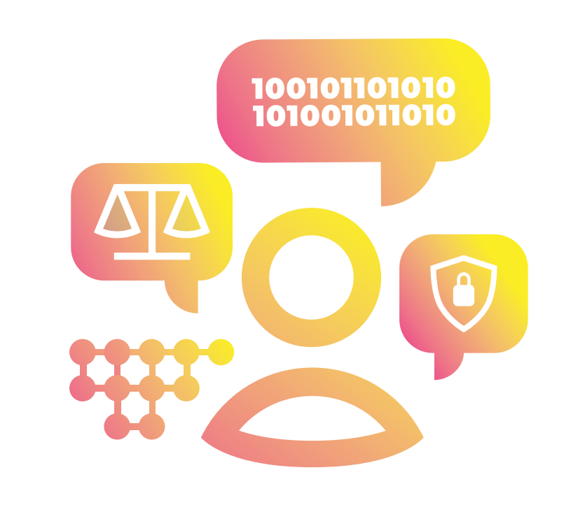
Open Call #2 User privacy and data governance