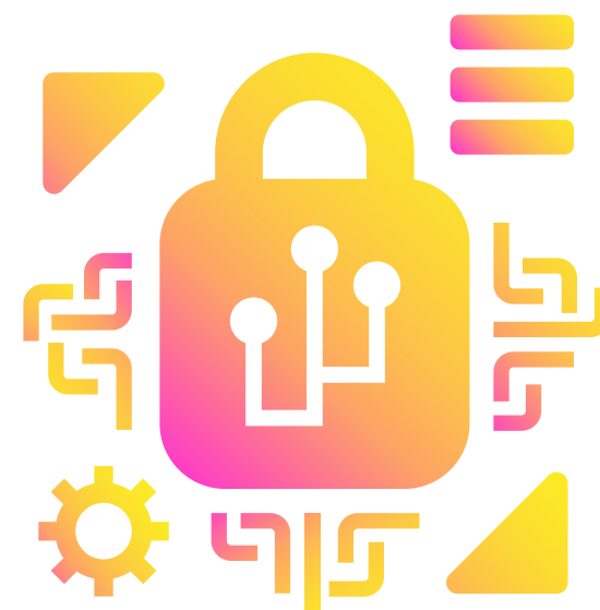
Multi chains support for NGI protocols