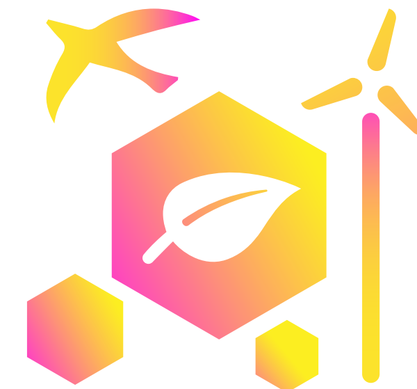
Green scalable and sustainable DLT