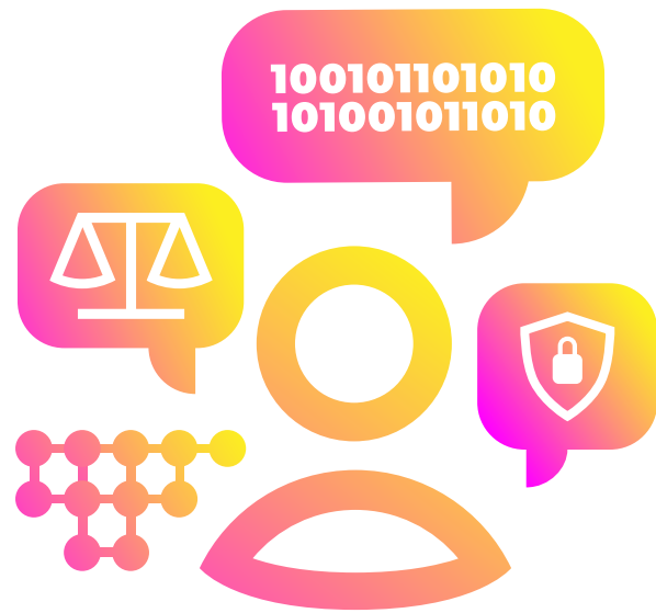
User privacy and data governance