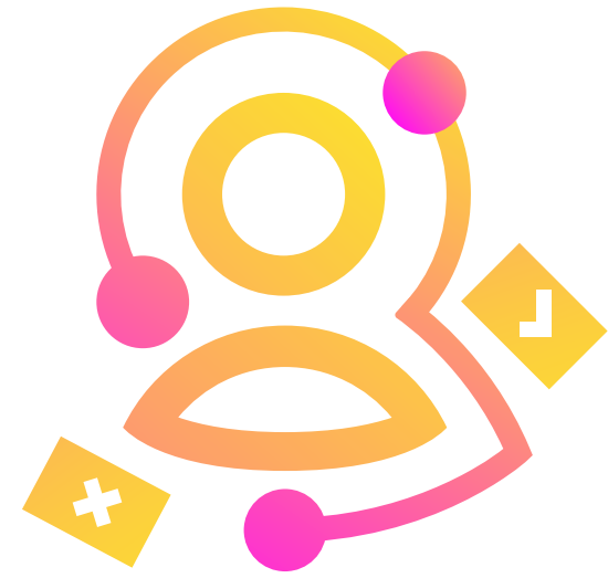
Decentralised digital identity